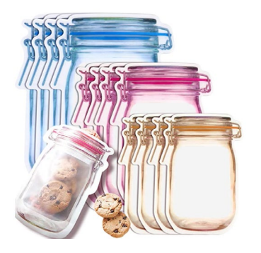
<u>Mason Jar Ziplock bags -</u> <u>amazon.com</u>