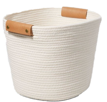
Rope basket - Target.com