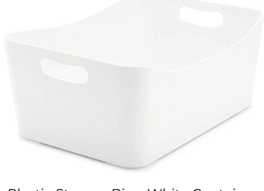
<u>Plastic Storage Bins, White Container</u> <u>for Shelves - amazon.com</u>