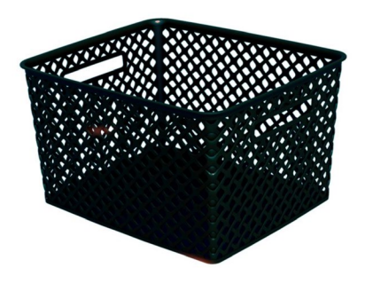
<u>Basket - Walmart.com</u>