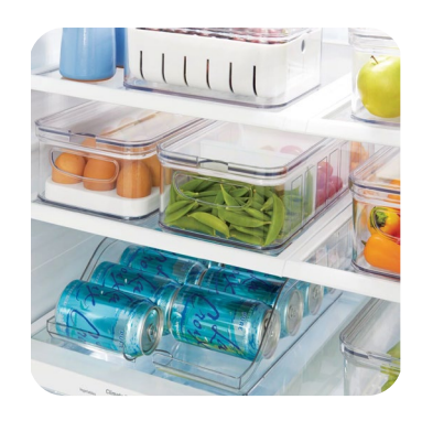
idesignlivesimply.com offers great fridge organization options