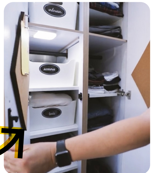
Example of how two different systems can co-exist

Once you've identified the areas you want to organize, talk to those sharing the space with you and make sure that they're on board with the plan. Involve them from the start and allow them to have input on common areas, then give them freedom to create their own system in their designated spaces.